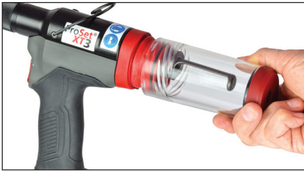
Quick release Mandrel Collection System MCS

The POP Avdel ProSet® XT tool line has many innovative high performance features including a patented "Quick Disconnect" nose housing and jaw case for rapid cleaning and maintenance of the front end without the need for any tools. The quick disconnect Mandrel Collection System (MCS) safely collects spent mandrels for quick, easy disposal and cleaner work areas. An air-isolation switch on the MCS prevents air flow when the MCS is disconnected. A left or right 90° swivel air fitting ensures the tools can be adapted to virtually any workstation configuration, while the "on/off" switch minimises air consumption and noise.