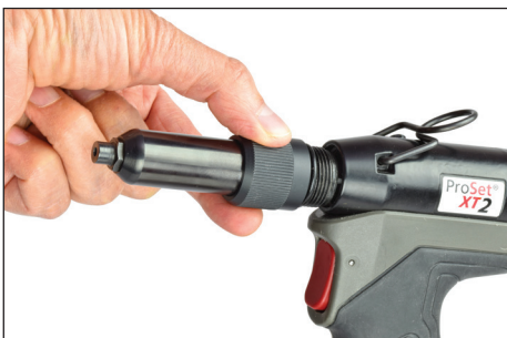
Quick disconnect nose housing and jaw case (without tools)